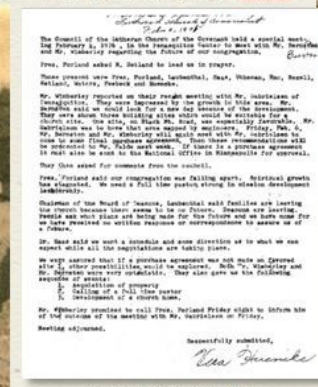
1976 | Church Council Minutes