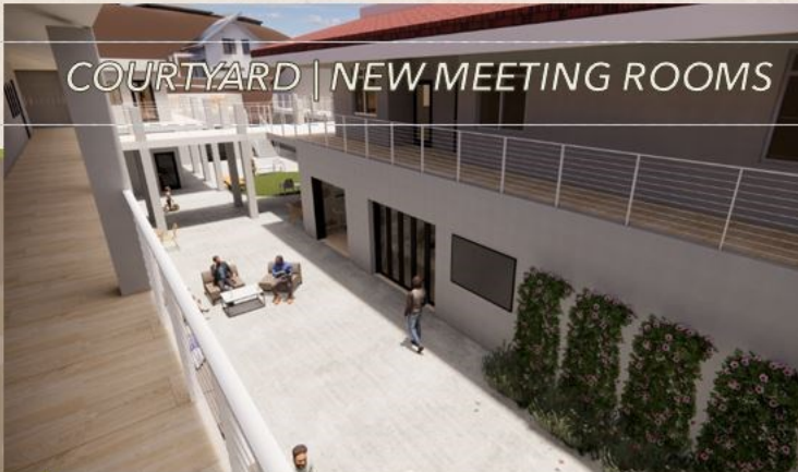
COURTYARD | NEW MEETING ROOMS