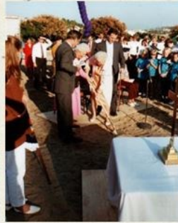
1993 | Sanctuary Groundbreaking