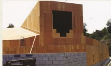
1994 | Sanctuary Construction