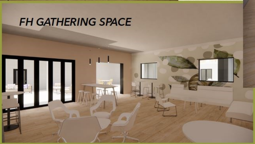
FH GATHERING SPACE